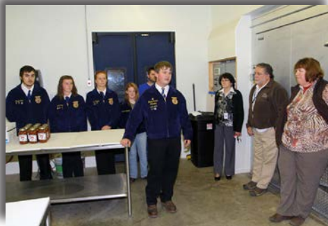
Mineral County FFA picked up a national award for being one of the best chapters in West Virginia at the FFA National Convention in Louisville, Ky. at the end of October. Their agriculture education programs are also involved in Farm to School and they have an excellent animal processing class.

superb farm-to-fork operation, and a true model for what agriculture can be in West Virginia. The Woodworth family raises, feeds, slaughters and market natural Angus beef. The also produce field crops and have a retail shop, a restaurant and ship orders to customers in multiple states. They are also supplying ground beef to several local school systems.