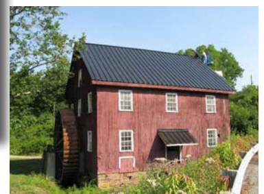
The new roof being completed on the Mill in 2008.

flume – what carries the water to the wheel – so that it can function.