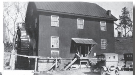
An early 1900s picture of the McNeel Mill.