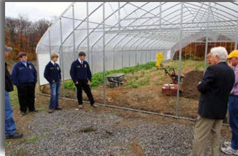
Tucker County FFA students are using a high tunnel and a greenhouse to grow produce throughout the summer months and into the fall. Students will also be experimenting soon with growing produce through the winter in one of the state's coldest environments.

While in Mineral County, we also paid a visit to Flying W Farms in Burlington. This is a