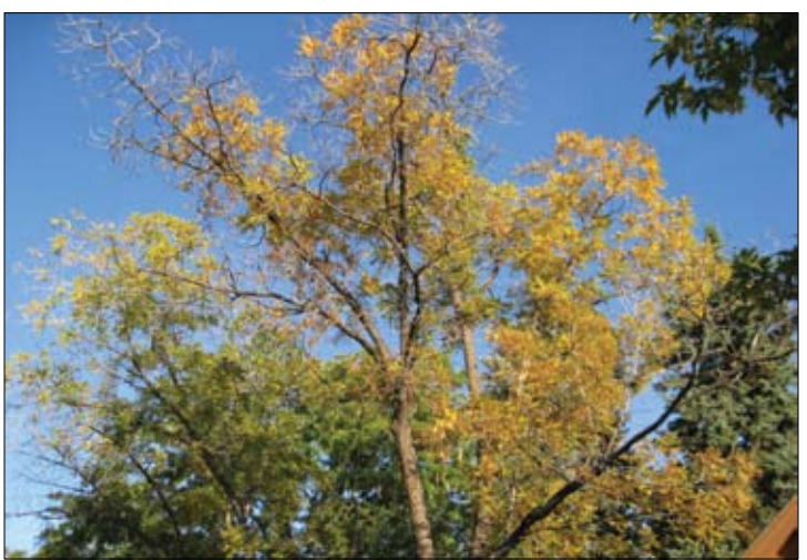
Figure 2. Wilting black walnut in the last stages of thousand cankers disease.

Figure 1. Thousand cankers disease has been confirmed in eight western states (outlined in red) as of April 2010. The year when symptoms were first noted is given. Native distributions of four species of western walnuts (blue) and eastern black walnut (green) are also shown. Eastern black walnut is widely planted in the West, but not depicted on this map.