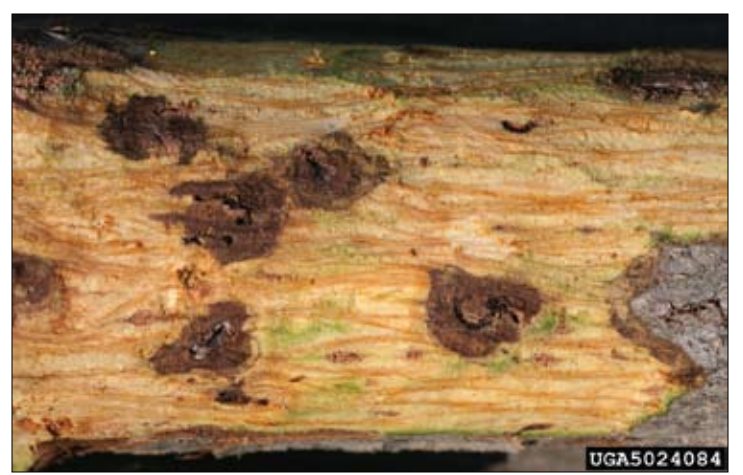
Figure 3. Small branch cankers caused by Geosmithia morbida.