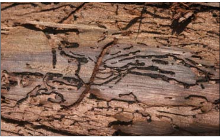
Figure 6. Walnut twig beetle galleries under the bark of a large branch.

in diameter and 6 to 12 inches long that has visible symptoms. Please submit branch samples to your State's plant diagnostic clinic. Each State has a clinic that is part of the National Plant Diagnostic Network (NPDN). They can be found at the NPDN Web site (www.npdn. org). You may also contact your State Department of Agriculture, State Forester, or Cooperative Extension Office for assistance.