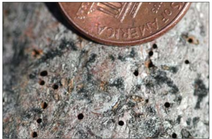
Figure 4. Exit holes made by adult walnut twig beetles.

related species. Aside from causing cankers, the fungus is inconspicuous. Culturing on agar media is required to confirm its identity. Adult bark beetles carry fungal spores that are then introduced into the phloem when they construct galleries. Small cankers develop around the galleries; these cankers may enlarge and coalesce to completely girdle the branch. Trees die as a result of these canker infections at each of the thousands of beetle attack sites.