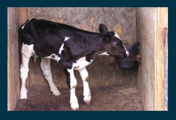
Veterinary Feed Directive Drugs Transitioning from Over The Counter (OTC) to VFD Status