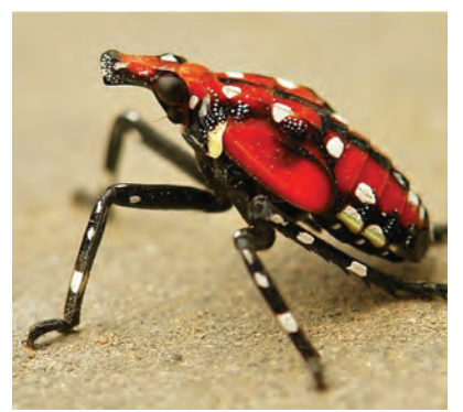
Nymphs turn red just before becoming adults.