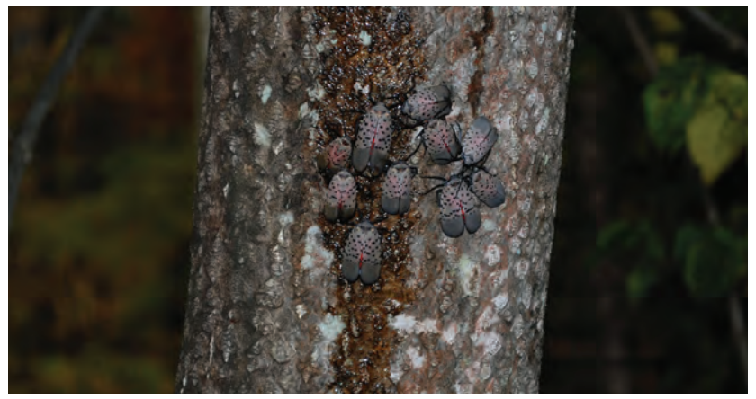
Cluster of adults on the trunk of a tree at night

For more information or to report infestations, please contact: West Virginia Department of Agriculture Plant Industries Division (304)558-2212 or send information to bugbusters@wvda.us.