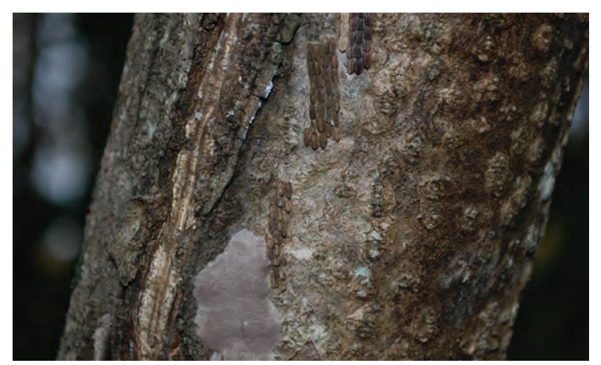
Hatched and unhatched egg masses