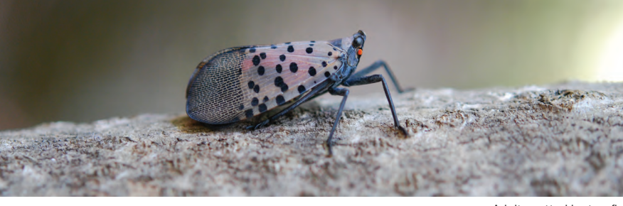
Adult spotted lanternfly

resulting in a fermented odor, and the insects themselves excrete large amounts of fluid (honeydew). These fluids promote mold growth and attract other insects.