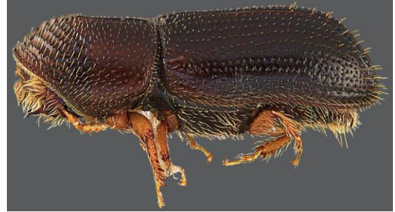
Figure 4. Walnut twig beetle, side view.

Description. The walnut twig beetle Pityophthorus juglandis is a minute (1.5-1.9 mm) yellowish-brown bark beetle, about 3X long as it is wide. It is the only Pityophthorus species associated with Juglans but can be readily distinguished from other members of the genus by several physical features (Figures 4, 5). Among these are 4 to 6 concentric rows of asperities on the prothorax, usually broken and overlapping at the median line. The declivity at the end of the wing covers is steep, very shallowly bisulcate, and at the apex it is generally flattened with small granules.