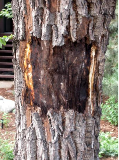
Figure 9. Large trunk cankers of black walnut associated with Fusarium solani .

A second canker type caused by the fungus Fusarium solani may occur on black walnut trees in advanced stages of decline. These diffuse cankers are much larger than those caused by Geosmithia and often exceed two meters in length, extend from the ground into the scaffold branches, and may encompass more than half the circumference of the trunk (Figure 9). Trunk cankers are not readily visible without removal of the outer bark. However, a dark brown to black stain on the bark surface or in bark cracks often indicates the presence of a canker. The inner bark and cambium below the bark surface on the canker face is macerated, water-soaked and stained dark brown to black. Fusarium solani has not been isolated from cankers surrounding walnut twig beetle galleries or directly from beetles.