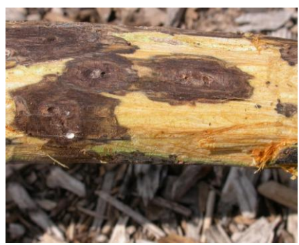
Figure 2. Coalescing branch cankers produced by Geosmithia . Note the whitish sporulation of Geosmithia in lower left gallery

Within the past decade an unusual decline of black walnut ( Juglans nigra ) has been observed in several western states. Initial symptoms involve a yellowing and thinning of the upper crown, which progresses to include death of progressively larger branches (Figure 1). During the final stages large areas of foliage may rapidly wilt. Trees often are killed within three years after initial symptoms are noted. Tree mortality is the result of attack by the walnut twig