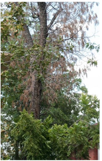
Figure 1. Rapidly wilting black walnut in the final stage of thousand cankers disease.

beetle ( Pityophthorus juglandis ) and subsequent canker development around beetle galleries caused by a fungal associate ( Geosmithia sp.) of the beetle (Figure 2). A second fungus ( Fusarium solani ) is also associated with canker formation on the trunk and scaffold branches. The proposed name for this disease complex is thousand cankers .