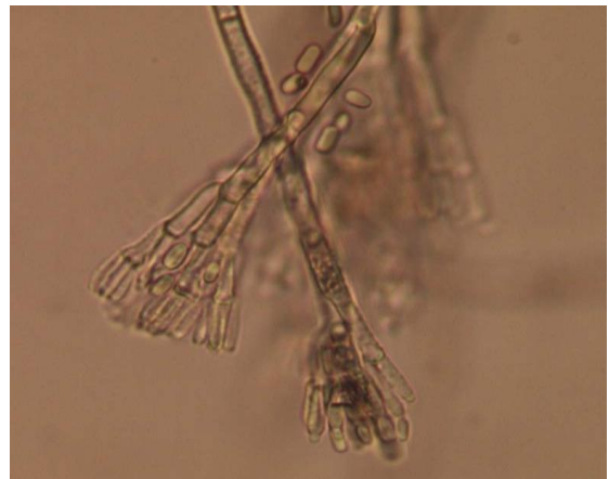
Figure 8. Conidiophores and conidia of Geosmithia

Two different types of cankers have been observed on declining walnut trees. Small, diffuse, dark brown to black cankers, caused by an unnamed fungus in the genus Geosmithia , initially develop around the nuptial chambers of the walnut twig beetle in small twigs, branches and even the trunk (Figure 8). Geosmithia spp. are associates of bark beetles of hardwood and conifer trees but have not previously been reported as pathogens of Juglans or fungal associates of P. juglandis . Branch cankers may not visible until the outer bark is shaved from the entrance to the