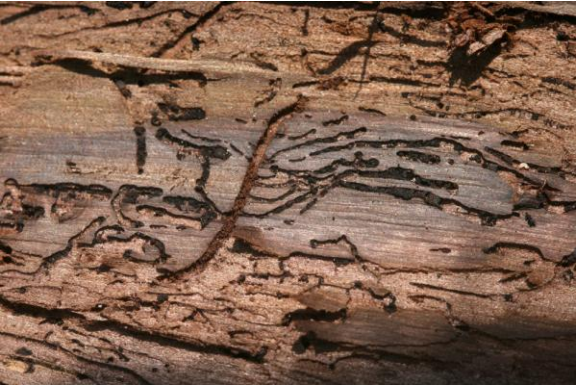
Figure 7. Walnut twig beetle tunneling under bark of large branch.

A single generation has been observed to be completed in less than two months. Yellow sticky trap sampling in Boulder, Colorado found adult beetles to be present from mid-April through early October, when sampling was discontinued. Peak adult captures occurred from mid-July through late August. These data suggest that two or more generations may be produced annually, which may increasingly overlap later in the growing season.