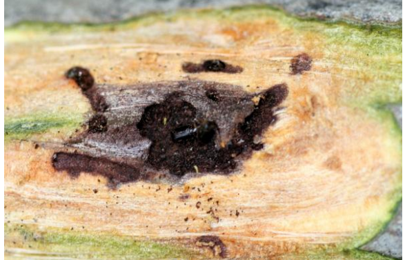
Figure 6. Walnut twig beetle and associated staining around tunnel.

Winter is spent primarily and possibly exclusively, in the adult stage. Adults initiate tunnels by early May, entering through bark crevices. During tunneling the Geosmithia fungus is introduced and subsequently grows in advance of the bark beetle (Figure 6). Ultimately a nuptial chamber is produced from which one or more radiating eggs galleries are excavated (Figure 7). Larvae develop just under the bark and then enter the bark to pupate.