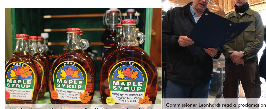
Heasley Homestead in Bruceton Mills offered up a variety of maple products for sale during their open house

For more information about the industry, contact the WVMSPA at https://www. facebook.com/wvmaplesyrup.