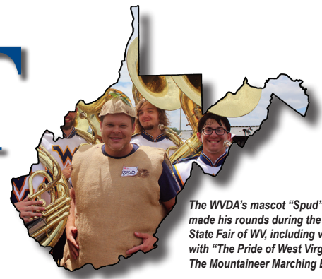
The WVDA's mascot "Spud" made his rounds during the State Fair of WV, including visiting with "The Pride of West Virginia" - The Mountaineer Marching Band.