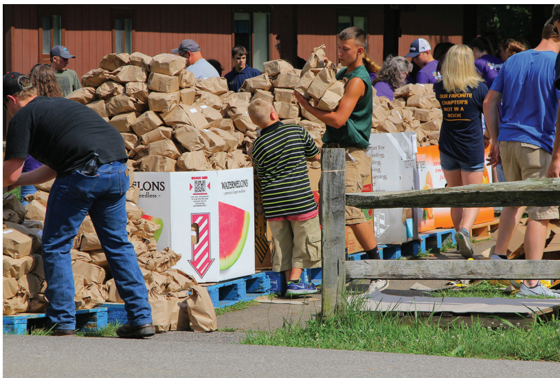
FFA students raised money that was used to purchase food that will provide 20,000 meals to food-insecure elementary school students in West Virginia. Each bag is enough for five meals and will be distributed by Mountaineer Food Bank to “backpack programs” that send food home with these students.

“This is one of the most awesome things I’ve ever done,” said Morris, who noted that FFA was also involved in a separate project to collect donations for flood victims in West Virginia.