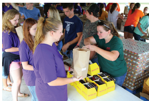
FFA members rotate through a buffet-style line, filling bags of food purchased by donations raised by FFA chapters throughout the state.