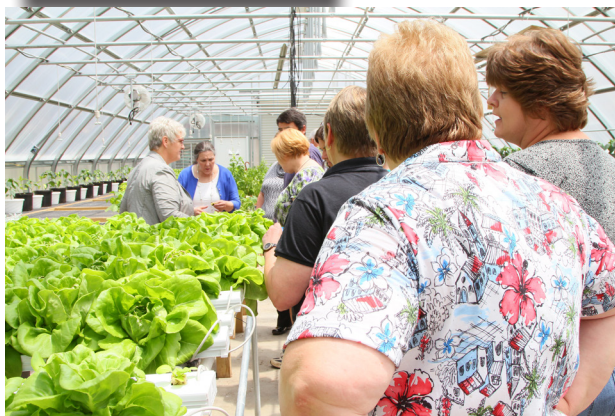
Participants tour the Tucker County High School greenhouse.