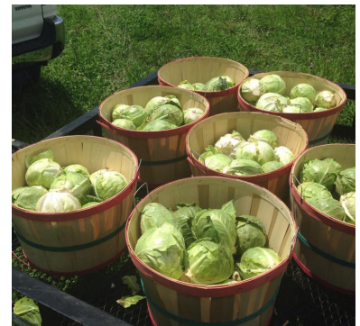
Seven bushels of cabbage on the way to the food bank. A portion of the Veterans to Agriculture crops go to local food banks and charities.

See what our Veterans to Agriculture Program has been doing: