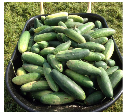
Loads and loads of cucumbers planted, cared for and picked by veterans at the Lakin veterans farm project. These were headed to The Wild Ramp in Huntington, WV.

For more information, visit the Facebook Page “Veterans and Warriors to Agriculture”