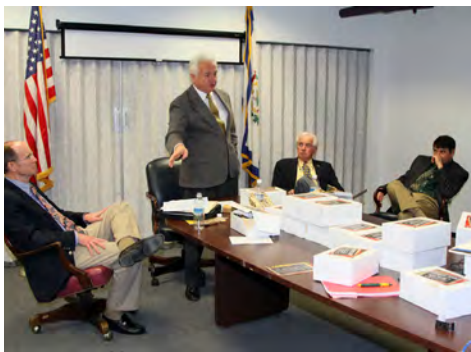
Commissioner Helmick addresses West Virginia Farm Bureau leaders and legislators at the Farm Bureau/Farm Credit legislative luncheon at the Capitol Building Feb. 10.

I have met numerous times with major food distribution executives who have operations in our state. They assure me that if West Virginians can grow it, they will buy it - and get it into our markets, schools, restaurants and other businesses in West Virginia.