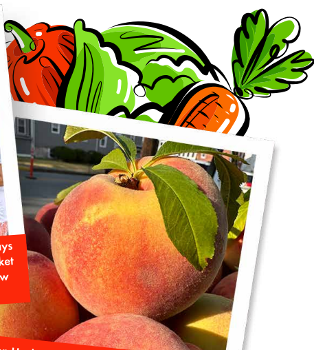
Gordon Hockman, co-owner of Twin Ridge Orchard, stresses their peaches are picked Friday to sell at the market on Saturday morning.

locally-raised beef and chicken, value-added products, plants, locally roasted coffee, fresh baked goods, ice cream, soaps and personal care items, set up shop from 9 a.m. to noon. Anywhere from 500 to 700 shoppers will make their way to the market and spend their money supporting local farmers and agribusinesses.