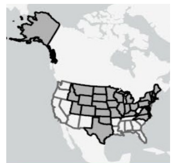
HPAI Affected States Shaded Gray - as of May 3, 2022

Highly Pathogenic Avian Influenza (HPAI), also known as Bird Flu, has been detected coast-to-coast in 2022 across North America in both wild and domestic bird species. Over 30 states have implemented eradication actions for affected commercial and backyard poultry operations. Approximately 70% of domestic poultry cases have occurred in commercial operations, including some large egg-layer facilities with over a million laying hens. All five states neighboring WV have had HPAI detections in domestic poultry, but thus far, there have been no detections in West Virginia birds. WVDA Animal Health Division personnel have conducted dozens of investigations of reported sick backyard poultry. In addition, commercial poultry managers have reported suspicious symptoms and submitted appropriate samples for testing. Collected swab samples are routed to the WVDA Moorefield Animal Health Diagnostic Laboratory for specialized influenza testing as part of the National Animal Health Laboratory Network. Our field and lab operations stand ready to respond should a HPAI finding occur for West Virginia.