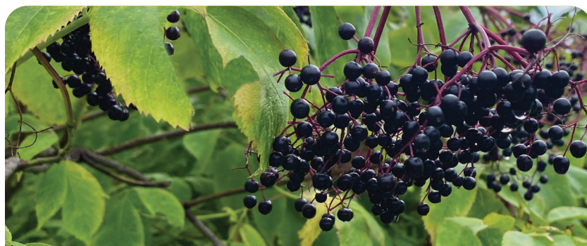
Elderberries have been used for centuries in folk medicine. Today there is a market for elderberries for both medicinal and culinary purposes.

The American elder ( Sambucus canadensis ), is a woody perennial found across Appalachia, usually in low areas such as fence rows or along the edges of woods or in riparian areas close to creeks or rivers. Elderberries do not compete well with other, taller, forest plants and, therefore, are often seen as an edge plant.