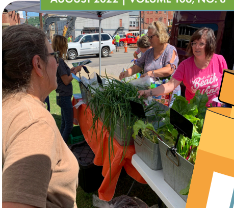
FARMacy patients shop for fresh, local produce at a pop-up farmers' market in Sistersville, one of the program's most successful sites.

A trip to the pharmacy usually entails picking up a prescription medication and forking over a hefty amount to cover the cost. But what if filling a prescription was as easy as shopping at your local farmers' market? Now it is for participants in the FARMacy West Virginia program. It's the brainchild of two West Virginia healthcare workers – Dr. Carol Greco and Physician's Assistant Amanda Cummins.