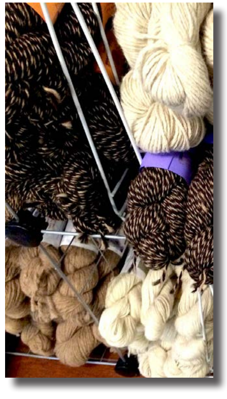
Much of Sodums enjoyment of her alpacas is watching them interact with each other. She also says the animals are "low maintenance, clean and easy to take care of." And their enviable fiber (right) is extremely soft and beautiful.

Once that's done, Barb opens the barn doors to let the alpacas out to pasture. The females are kept separate from the males until its breeding time. Most days the alpacas spend their time in the fields grazing. They almost always stay in small groups.