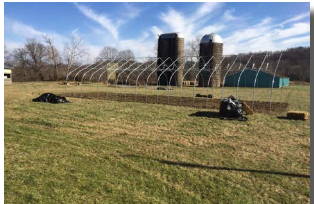
Old silos dot the background as the new Veteran's high tunnel is taking shape at the WVDA farm at Lakin.

This should greatly assist those producers and we are happy to see this project coming to fruition.